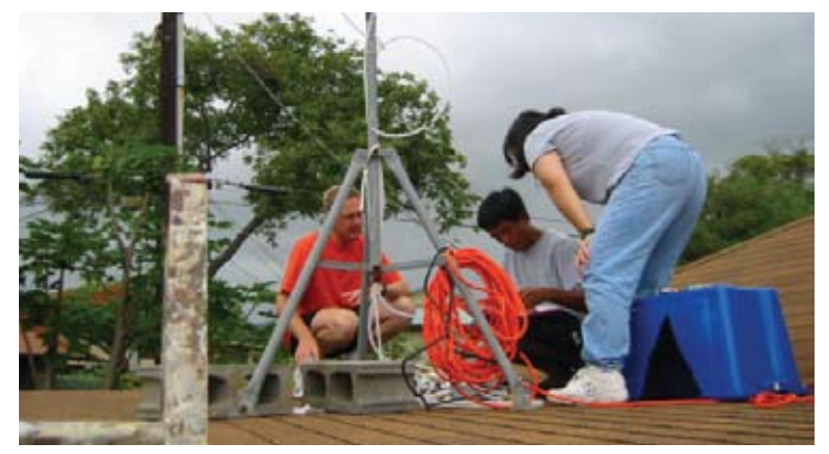
Researchers collect airborne samples of VOG.