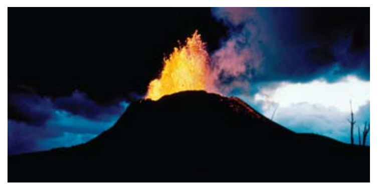
Volcanic Organic Gas (VOG) eruptions have been associated with respiratory complaints in Hawai'i and are one area of active study by RMATRIX investigators.

"It is somewhat overwhelming," said Dr.Shiramizu. "But understanding and addressing these health outcome disparities in our multicultural setting will help our nation as a whole answer why some diseases are more prevalent in minority populations and what can be done to reduce the burden of these diseases."