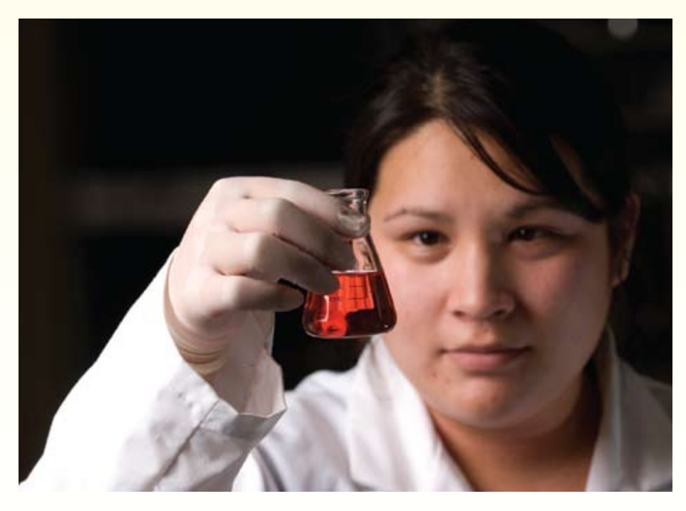
Transferring research results from labs at the John A. Burns School of Medicine to patients for better health is the goal of the new RMATRIX program.

"RMATRIX leadership will be tested," he said, "by having to successfully engage our experienced health disparities investigators, and then to incorporate and commit appropriate RMATRIX core activities in order to develop meaningful translational research studies. Ultimately, what will be needed are manageable outcomes with discrete endpoints."