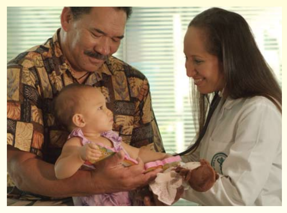
Assessment of children in Hawai'i through the National Institutes of Health (NIH) sponsored National Children's Study and other pediatric-focused projects will be a vital part of RMATRIX.

n RMATRIX Council will develop loperating policies and monitor progress in research programs designed to help to reduce and eliminate health status differences in population subgroups (i.e., health disparities). Members of the Council include leaders of different disciplines at UH-Mānoa and UH-Hilo, community representatives and the Research Centers in Minority Institutions (RCMI) Translational Research Network. The Multidisciplinary Research Education, Training and Career Development Program will be used to develop careers, train and expand research experiences for investigators and clinicians to engage in clinical and translational research projects for RMATRIX.